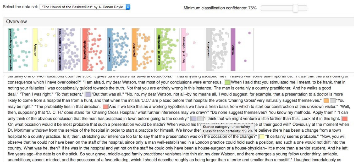
Figure 2: A prototype visualization of stance classification results for literature.

We also demonstrate how visual stance analysis could be practically applied to literature studies by combining the automatic stance classifier with text visualization principles (Kucher & Kerren, 2015). Our prototype depicted in Figure 2 provides an overview of stance classification results for a fiction text (divided into utterances). The overview consists of scatter plots for individual stance categories, resembling the document overview in uVSAT (Kucher et al., 2016). Each positively classified utterance is represented by a dot marker in the corresponding plot, and its position in text is mapped to the dot's position. The overview supports details on demand and navigation over the text. The prototype also provides a detailed text view with stance category labels and details on demand, thus supporting both distant and close reading approaches (Jänicke, Franzini, Faisal, & Scheuermann, 2015). Furthermore, classification confidence values reported by the classifier are mapped to the opacity of overview markers. They are also used for filtering to focus only on more reliable results. The prototype can be used to estimate the number of utterances with detected stance in a given text, compare the results for several stance categories, and explore the text in detail. With the stance classification accuracy improving over time, we believe such an approach could be useful for scholars in Digital Humanities.