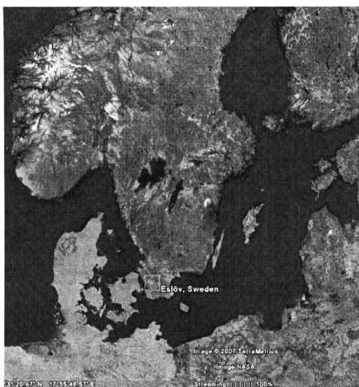
Figure 1. Location of Eslöv municipality in the southern part of Sweden (from Google Earth 2007).

Commodities containing substances identified as hazardous were in the next step evaluated in order to find possible actions, e.g., implementation of source control options.